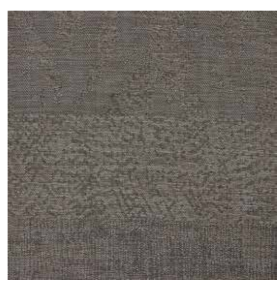
Milo (LRV - 13.0)

The Light Reflectance Value (LRV) indicates the extent to which the light is reflected from a surface illuminated by a light source. It refers to the total amount of visible and usable light (of all wavelenghts and in all directions) reflected from all surfaces present.