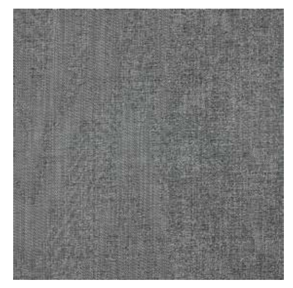
Jade (LRV - 16.7)