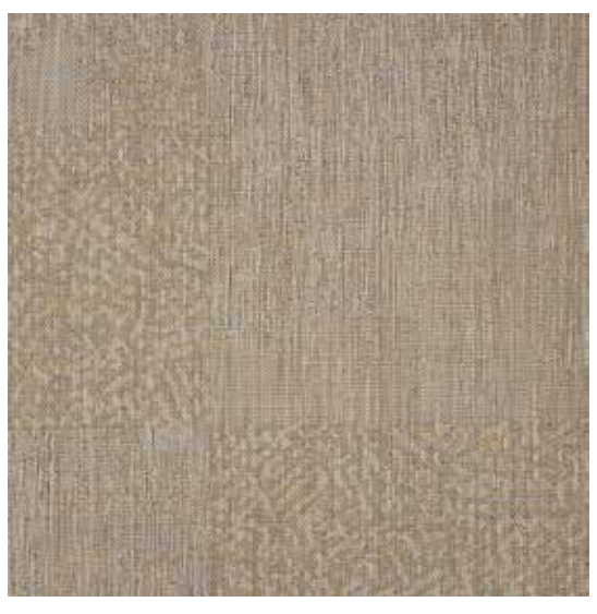
Julia (LRV - 26.1)