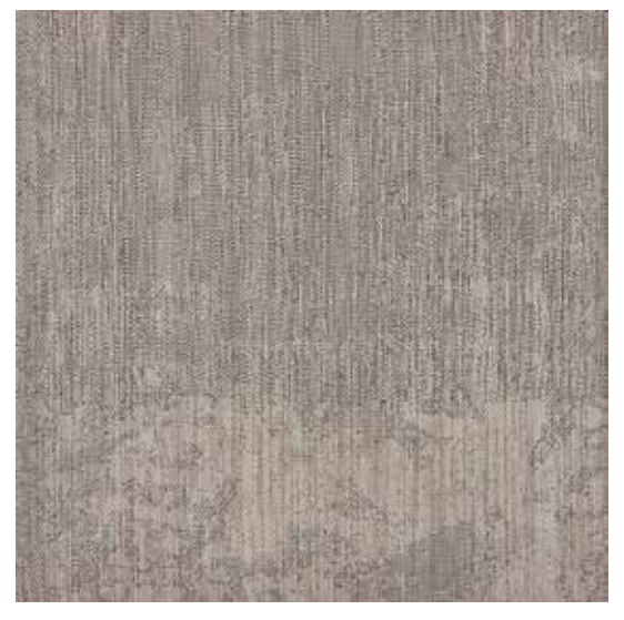
Leon (LRV - 22.4)