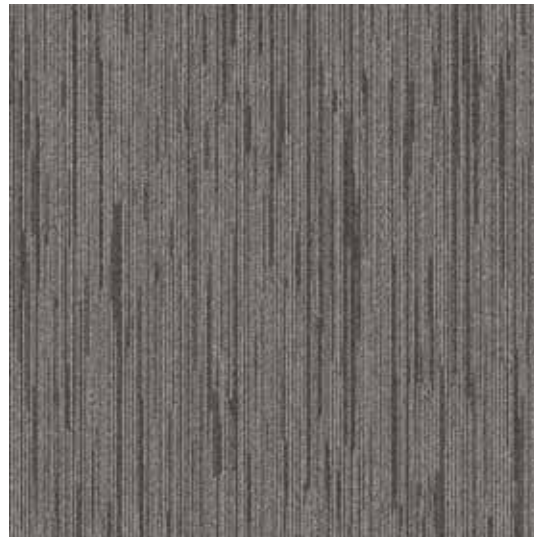
Double Take 400041