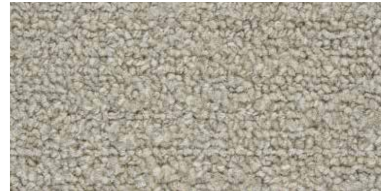
A la Carte 400569