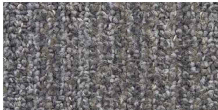
Bon Appetit 400565