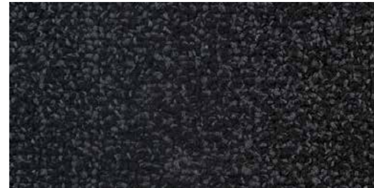
Savoir Faire 400568