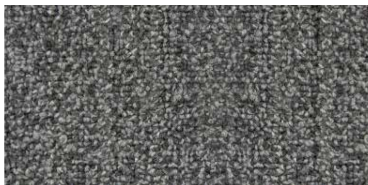
Grand Prix 400566