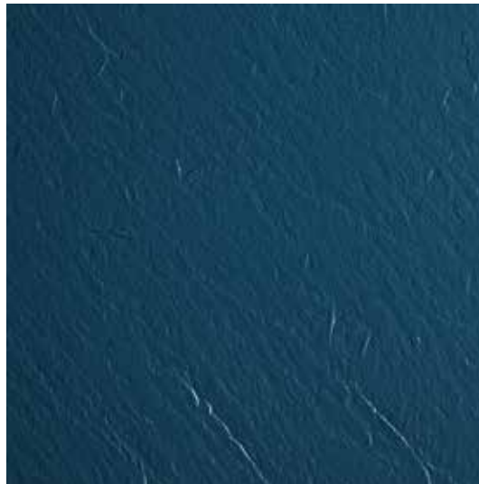
Night Sky - MCA91 * LRV 6.5