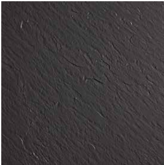
Carriage Grey - MCA37 * LRV 8.3