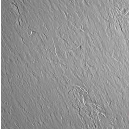
Polished Pewter - MCA33 * LRV 24.7