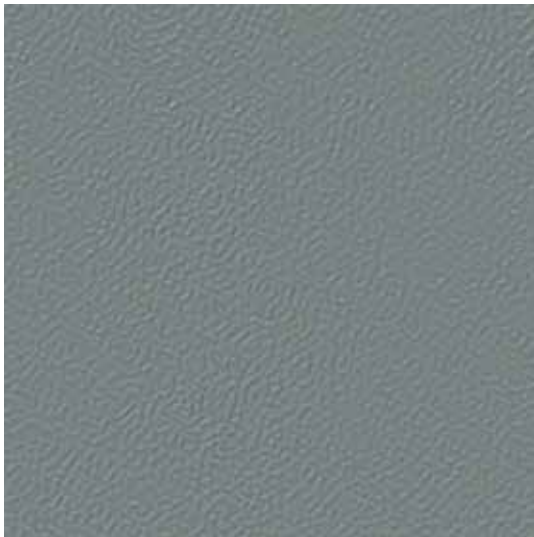
Polished Pewter - MCH33 # LRV 24.7