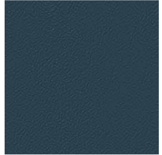
Battle Grey - MCH24 # LRV 10.1