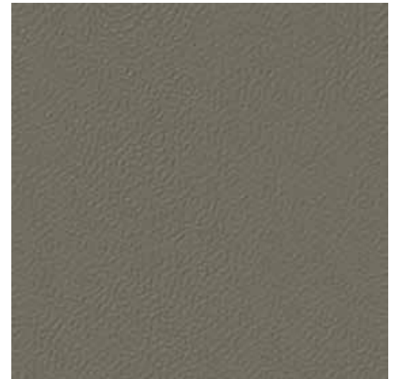
Warm Stone - MCH38 # LRV 20.8