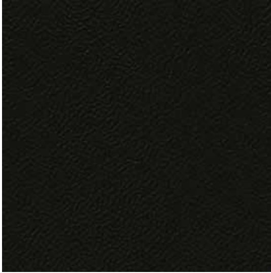
Onyx Black - MCH20 # LRV 15.1