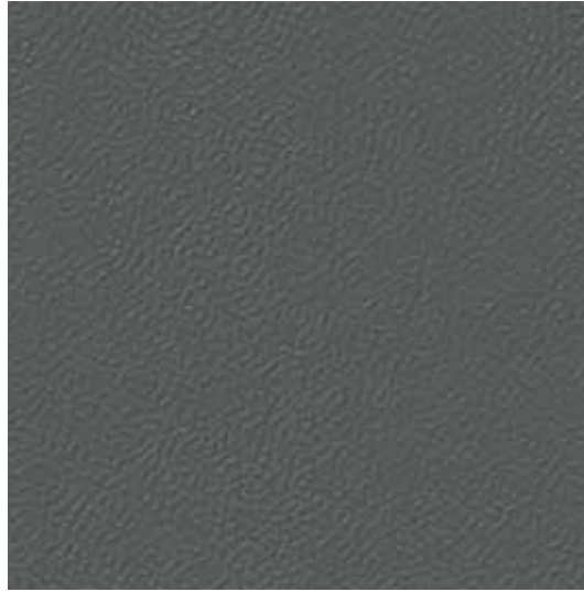
Spy Grey - MCH22 # LRV 11.2