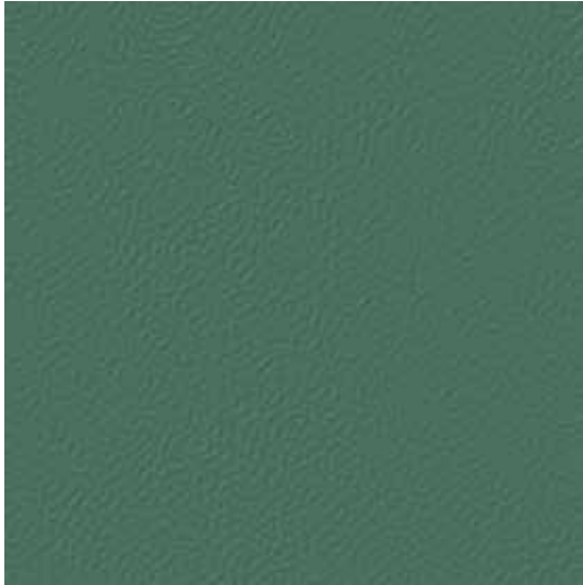
Equilibrium Green - MCH85 # LRV 18.6