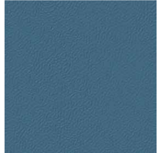
Lake Blue - MCH96 # LRV 16.5