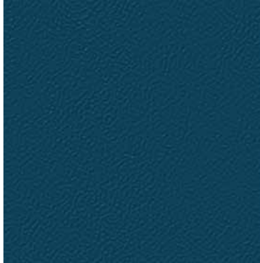
Night Sky - MCH91 # LRV 6.5