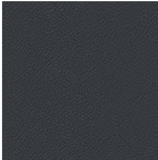
Carriage Grey - MCH37 # LRV 8.3