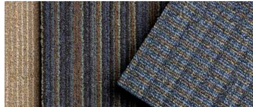
CLOCKWISE — AFTERMATH 03026 Flannel 23509 BEDLAM 02982 Coal 16312 · TURMOIL 02930 Donegal 15305 HAPHAZARD 03028 Particolor 13508 · BEDLAM 02982 Sorrel 16303